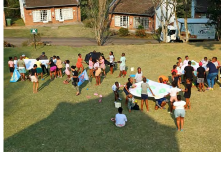
Team building is also for 'older' kids ...AFM Gibson Gate Mission

God has been gracious and we've been reasonably busy at the Centre with large groups such as Groundworks, Northwest University, two Emmaus Walk groups, and two groups of learners from Scottsville Primary School on teambuilding. One of the Scottsville learners renamed us 'Africa Enter the Prize' (click to view); we'll take this as a 'prophetic' word 'out of the mouths of babes'!